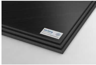
Polystone® P HG EHS black

For more information about technical data, product handling, certifications, compliance or delivery program scan the QR-Code and visit our website or talk to our experts.