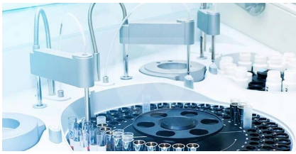
Aplicações de centrifugação

Röchling Industrial. Empowering Industry. www.roechling.com/industrial